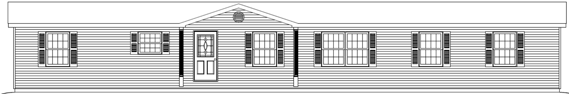
Front Elevation 12892D